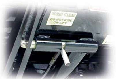
Easy access and highly visible, heavy-duty Latch Pin Assembly positively secures gate in closed position. This Anthony standard feature is the strongest and most visible latch in the industry.