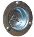
Recessed Toggle Switch (optional)