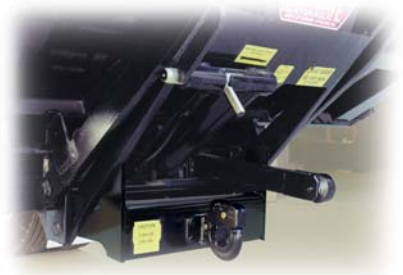
Optional 5 & 12 ton Pintle Hook Brackets