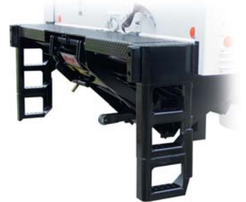
Optional maximum duty dock bumper with third step add-on