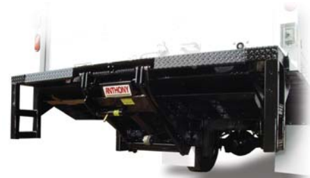
AST in stored/travel position, shown with optional dock bumpers

* NOTICE: Some models of Anthony Liftgates may be provided with step devices to assist the ingress and egress of the truck or trailer rear. These devices are NOT to be considered ALL INCLUSIVE of any requirements or guidelines regarding proper ingress and egress of trucks and trailers. These items are provided as only an added feature for installers to help simplify the meeting of possible ingress and egress requirements. As there are many variables in truck sizes and shapes, it is the installer's responsibility to determine proper ingress and egress requirements, such as steps and hand grips, for each vehicle receiving an Anthony liftgate.