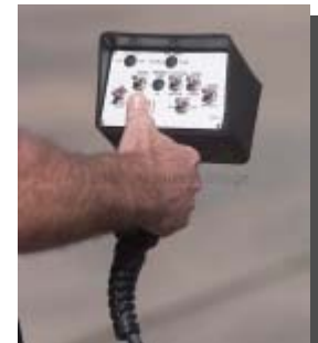
Remote electric control allows operation from the ground.