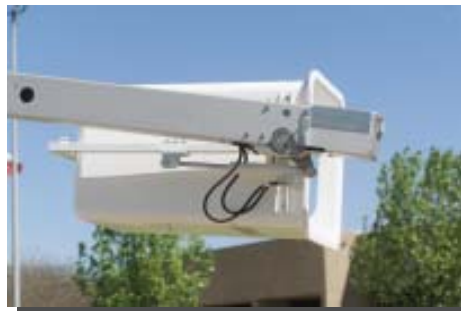
Hydraulic leveling allows for simplified clean out.