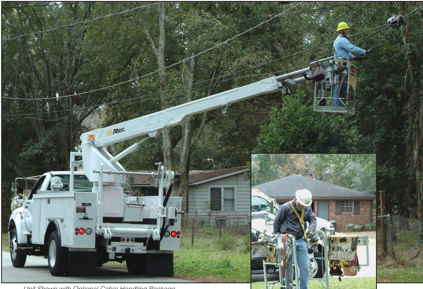
Unit Shown with Optional Cable Handling Package