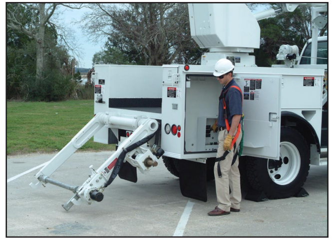
Reel Lifter Goes to Ground for Ease of Loading Reels