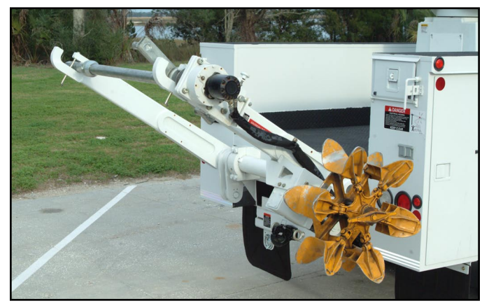
Optional Capstan Winch and 500 lb Reel Loader/Driver

Based on 40 in (1016 mm) chassis frame height