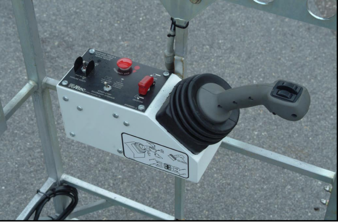
Single Handle Fully Proportional Controls

Altec Industries, Inc. Post Office Box 10264 Birmingham, Alabama 35202 Phone 205/991-7733 Fax 205/991-9993