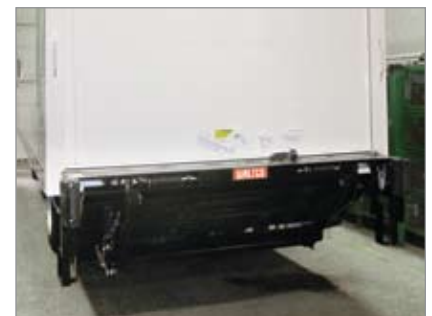
E Series Gate in stowed position