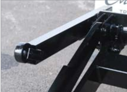
Torsion Spring Assist Allows Platform to be Folded with Less Force.