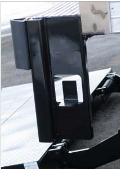
Optional Steel Dock Bumper w/Step and Rubber Pad.