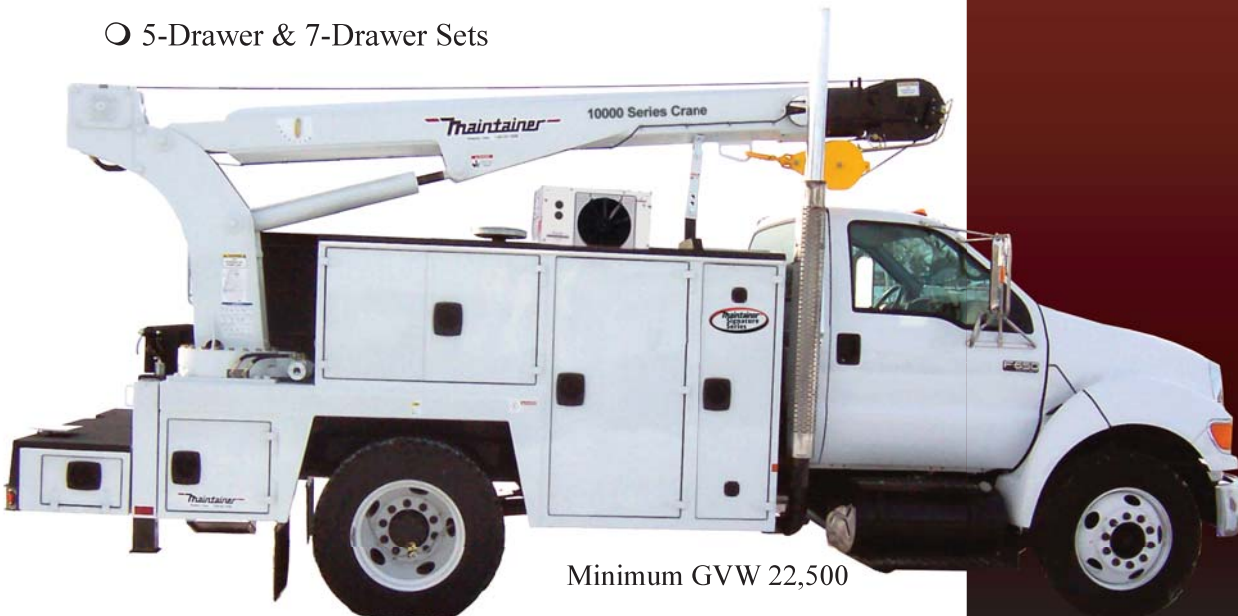
Minimum GVW 22,500

Meets OSHA 1910.180 requirements and ANSI B30.5 safety standards