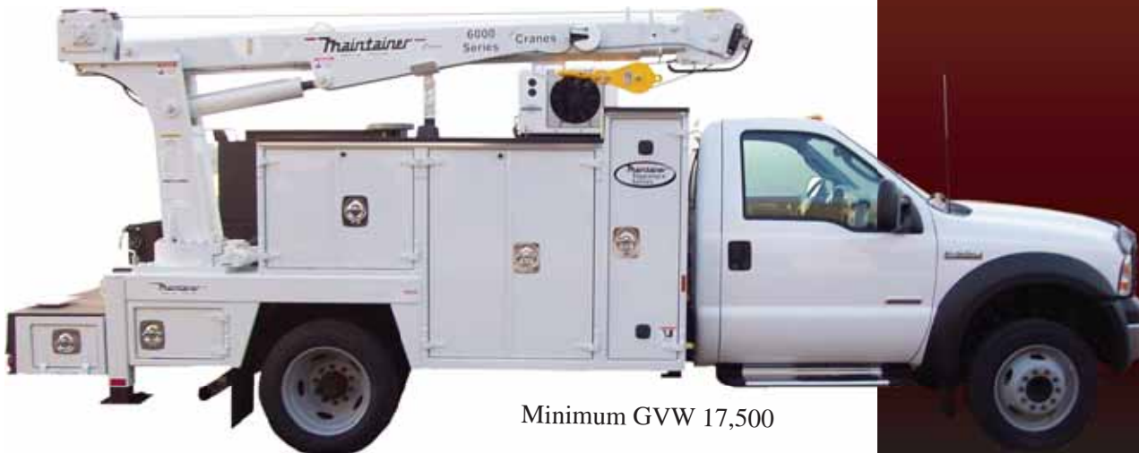
Minimum GVW 17,500

Maintainer Corporation of Iowa, Inc 1701 S. 2nd Ave Sheldon, IA 51201 800.831.8588 * www.maintainer.com