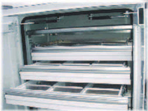
2-way drawer dividers

Light weight aluminum design reduces weight by 20% versus competitive steel drawer sets.