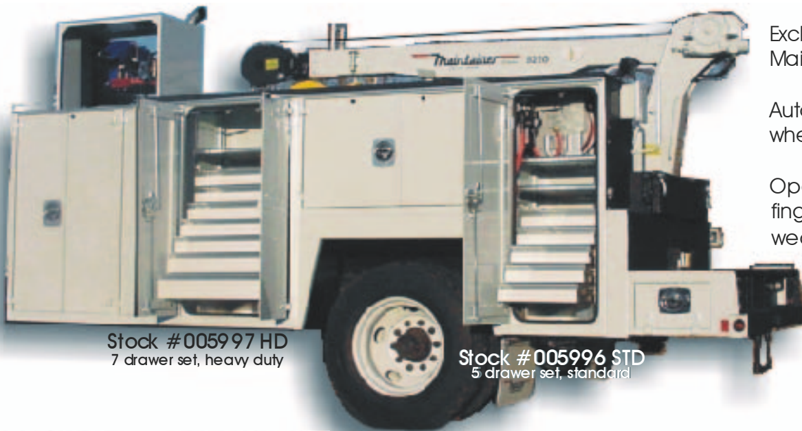
Stock #005997 HD 7 drawer set, heavy duty