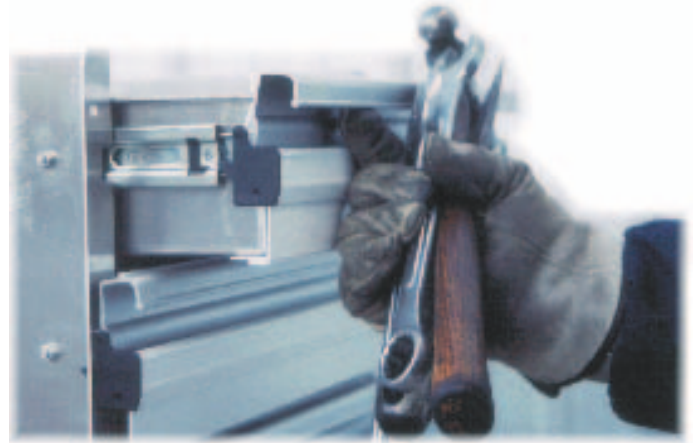
Easy open latch