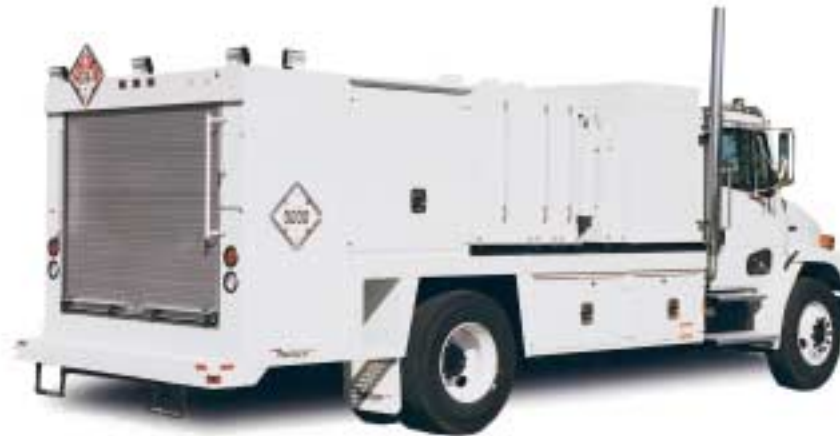
MTL2 (2-ton lube body)