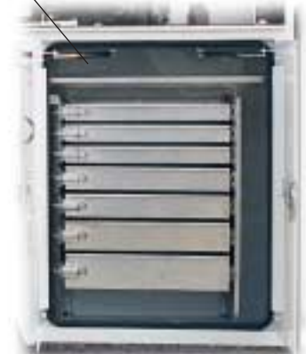
Heavy Duty 250-lb. Capacity Roll-Out Drawers

When it comes to field service, Maintainer has a body that will get the job done quickly and efficiently for you. Maintainer features a wide variety of options to meet your exact needs.