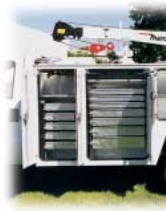
Galvanized Heavy to Fit