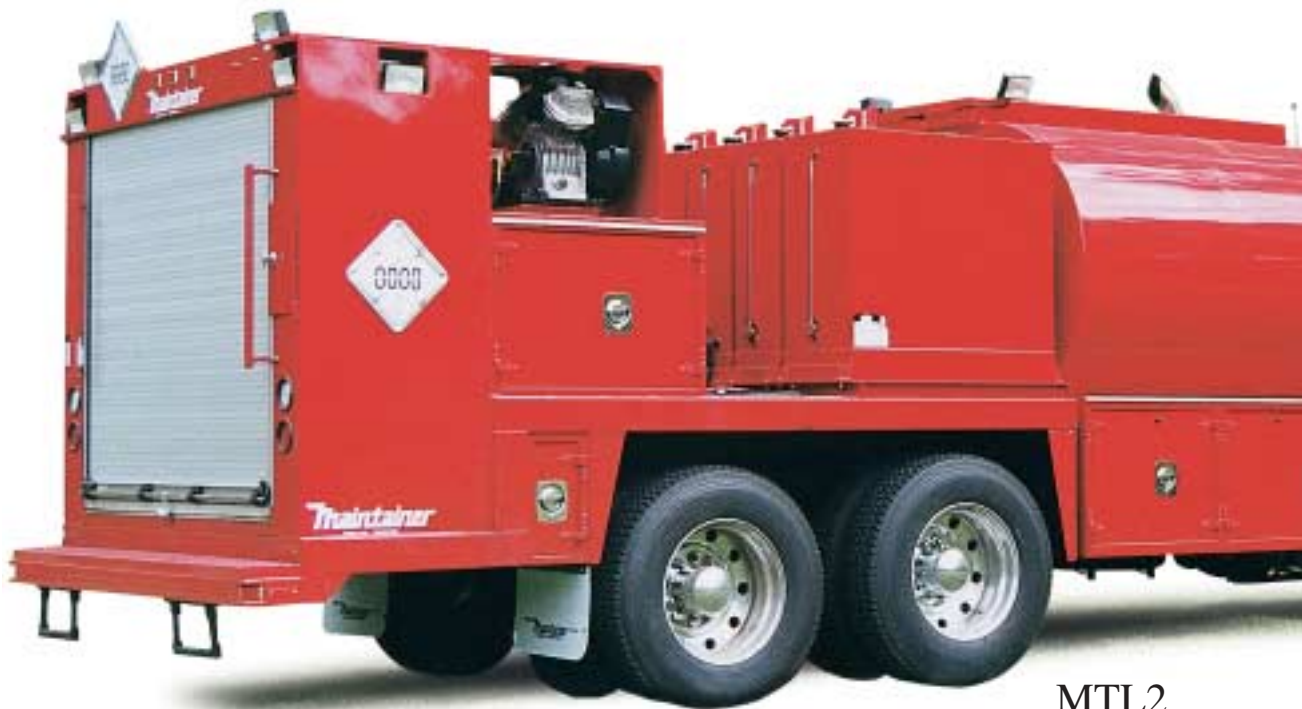
MTL2 (2-ton lube body)

Maintainer offers a wide range of heavy duty lube bodies and lube skids that meet the end user's exact needs. Both air and hydraulic product distribution systems are available.