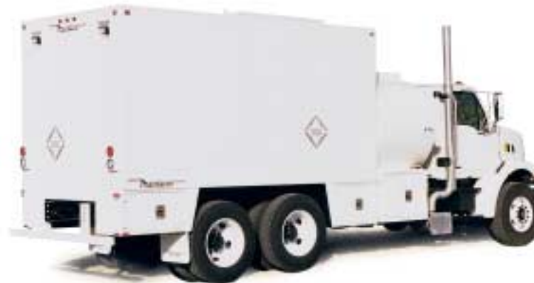
MTL2 (2-ton van style lube body)

For more information on accessories see Maintainer tab