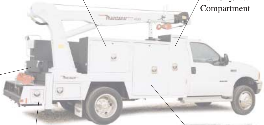
Tough Line-X Protective Coating Applied to Bumper and Cargo Area.