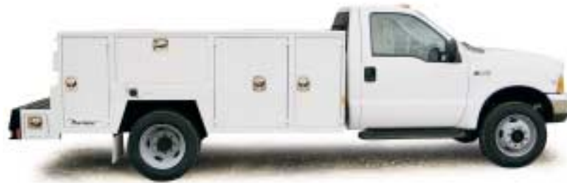
MTS1 (1-ton service body only)