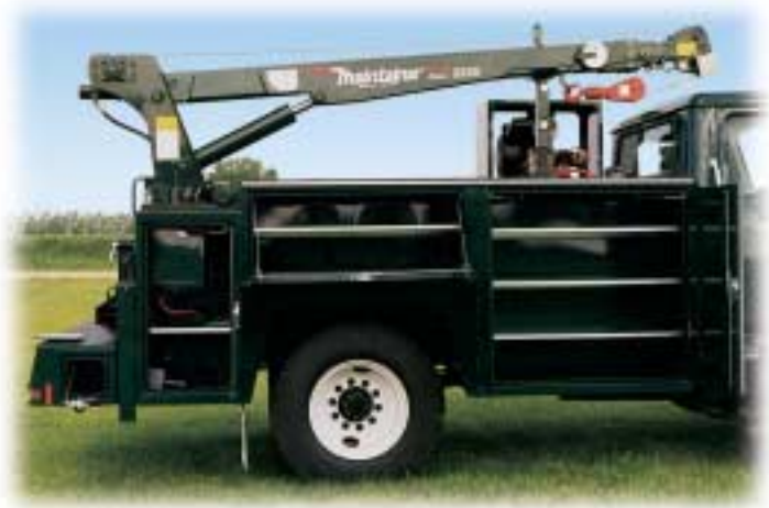
Short Tower Crane

Maintainer offers a wide range of hydraulic telescoping boom cranes, both short and tall tower configurations, from 3,500-lbs. to 14,000-lbs. capacity... plus a 12-volt model 657 E-Z Pick 2000-lb. electric crane.