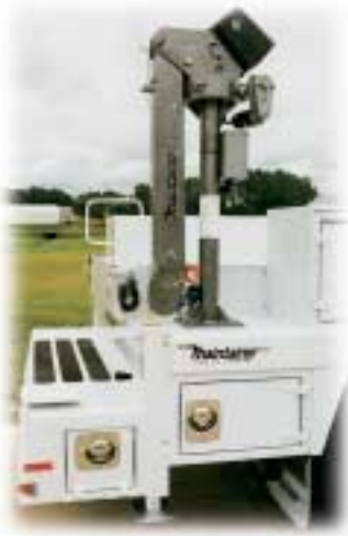
E-Z Pick Electric Crane