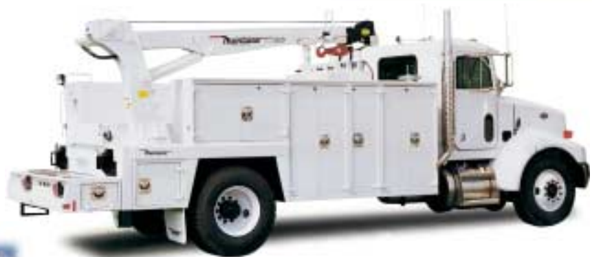
MTSL2 (2-ton service/lube body)