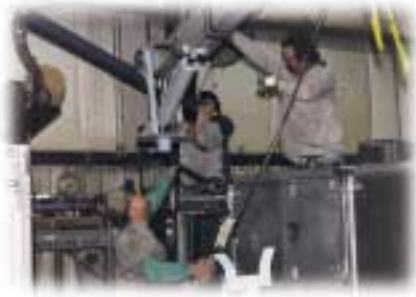
Crane base ties directly into body substructure