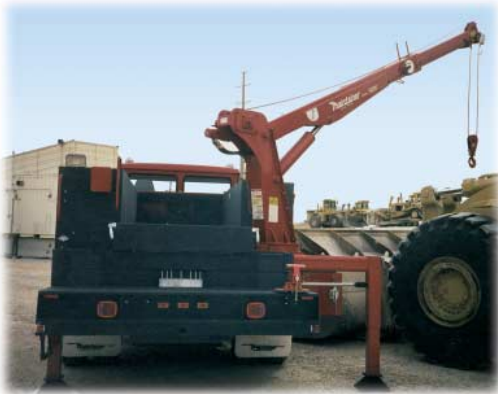
Tall Tower Crane

Maintainer offers a wide range of hydraulic telescoping boom cranes, both short and tall tower configurations, from 3,500-lbs. to 14,000-lbs. capacity... plus a 12-volt model 657 E-Z Pick 2000-lb. electric crane.