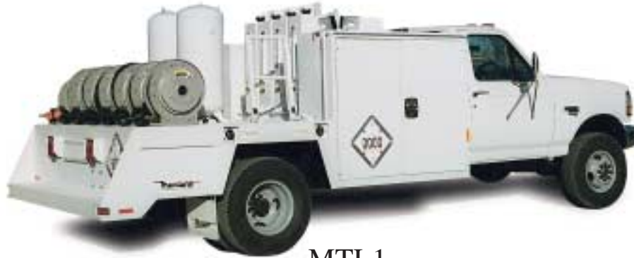
MTL1 (1-ton lube body)