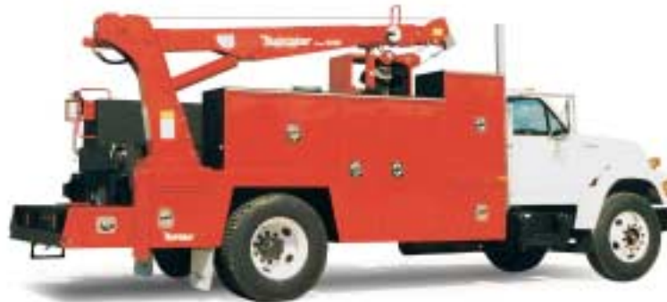
MTSC2 (2-ton service body w/crane)

For more information on accessories see Maintainer tab