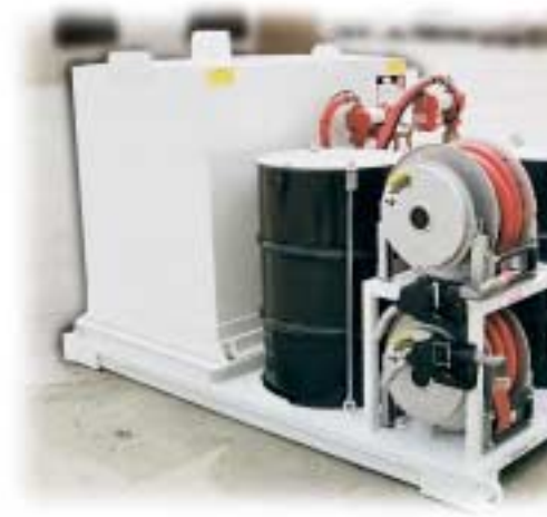
MTLS (lube skid)