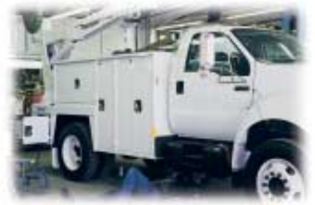
Body substructure ties directly into chassis frame rails