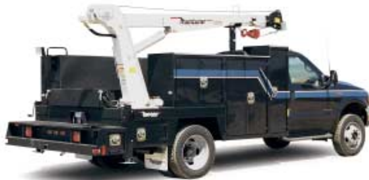
MTSC1 (1-ton service body w/crane)