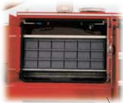
Small Parts Bins