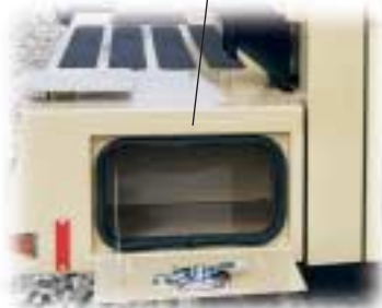
Work Bench Bumper with Vise Mount and Side Compartments