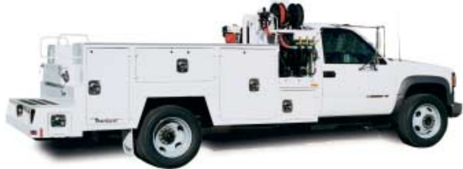
MTSL1 (1-ton service/lube body)