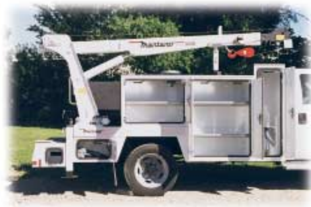
Galvanized Fixed or Adjustable Shelves