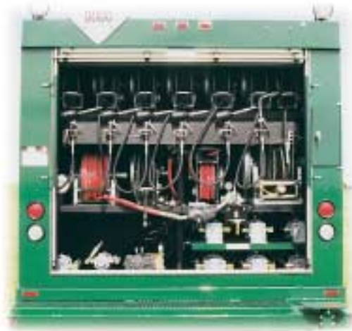
Enclosed Hose Reel Compartment