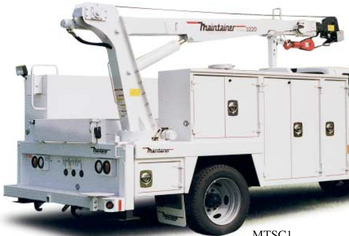
MTSC1 (1-ton service body w/crane)

Maintainer Service Bodies are built to meet the most rugged on/off road conditions. Maintainer specializes in custom designed bodies that meet the highest quality standards.