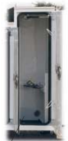
Tall Oxy/Act Compartment